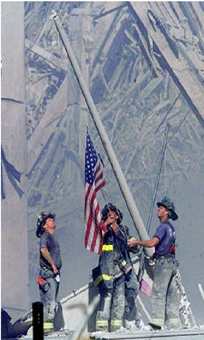
God Bless America September 11, 2001

THE OFFICIAL NEWSLETTER OF THE AKRON FIRE DEPARTMENT